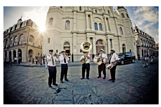
There's No Place Quite Like New Orleans!

Back by popular demand will be our second annual service project . The AIAMC is partnering with HandsOn New Orleans, with meeting attendees assembling beaded bracelets containing positive messages in Morse Code. After the conference, the bracelets will be distributed to STEM students in local New Orleans schools. The 2025 Annual Meeting will be held at the at the memorable Loews New Orleans Hotel . The hotel is located just three blocks from the French Quarter, Aquarium of the Americas, and various riverfront attractions. Our special conference rate is $269/ night. The conference agenda may be viewed at <a href="www.AIAMC.org">www.AIAMC.org</a> — Upcoming Events. On-line registration will open in early November . Register by January 15<sup>th</sup>, and you will receive a 10% discount. Save the date now and plan to attend!